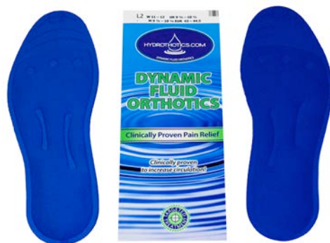
Hydrothotics (HY0001 - 8) Dynamic Foot Massage Insoles